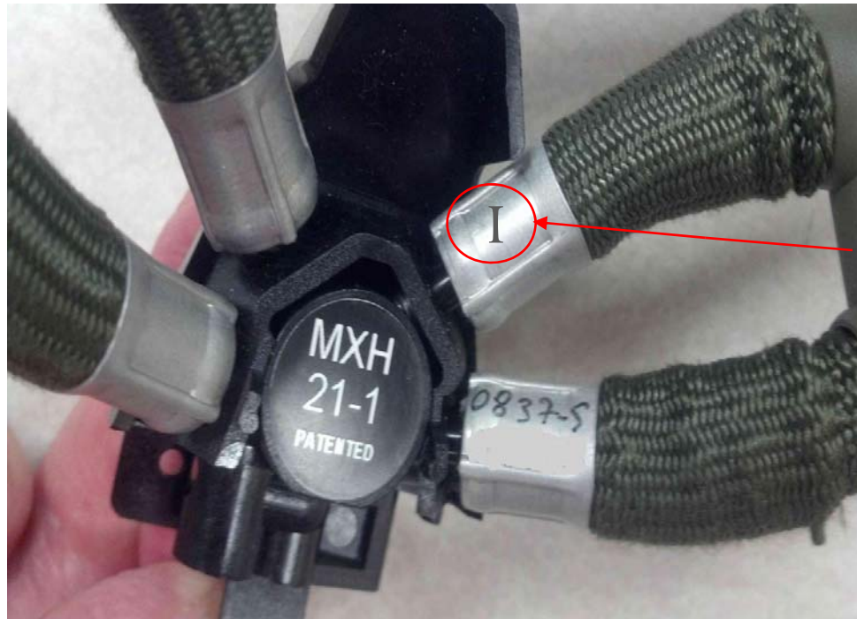
Figure 1 – “I” Letter Position

The form attached in appendix II is to be filled by the customer and attach to the PO.