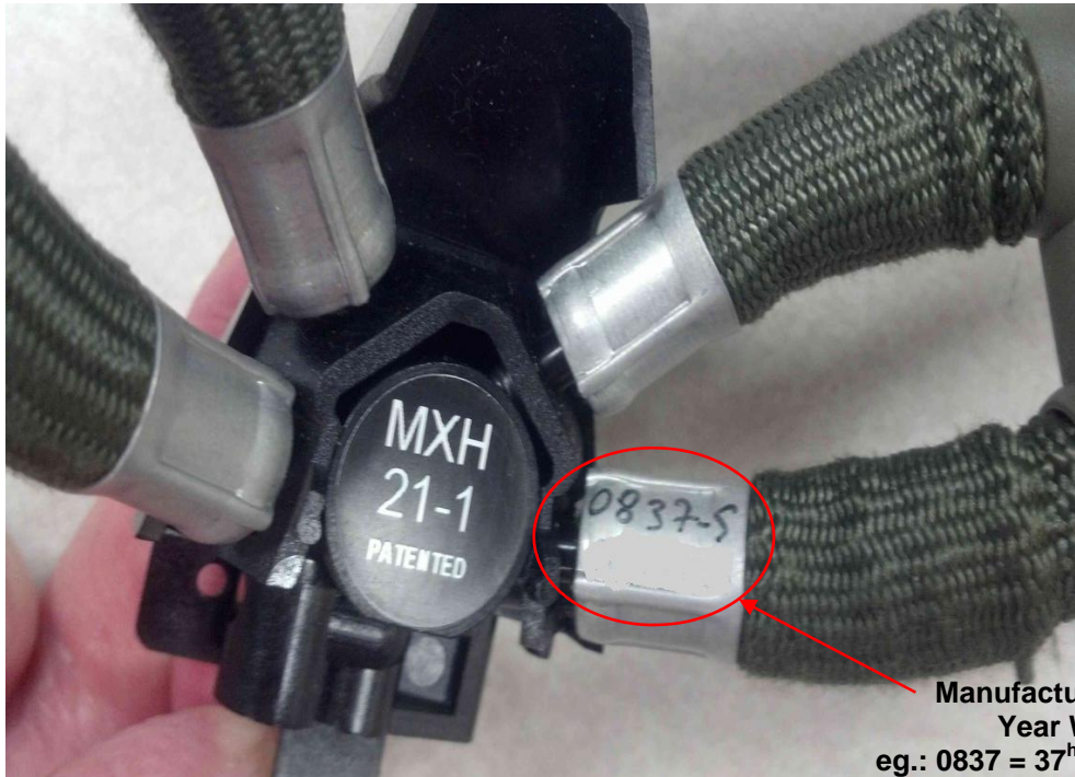
Manufacturing Date Year Week eg.: 0837 = 37 h week of 2008