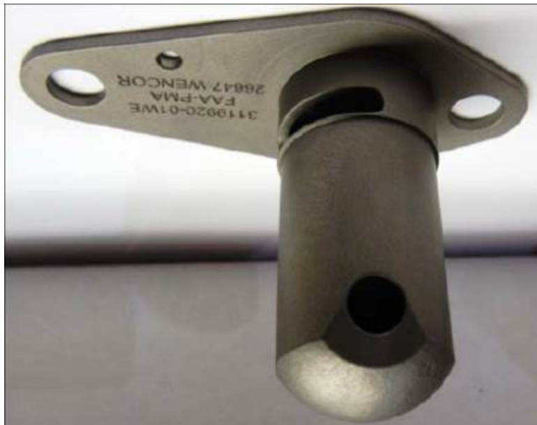
Figure 1 – Fuel Nozzle Sheath

While developing the fuel nozzle sheath, P/N 3119920-01WE, Wencor made the lower portion of the cap thicker than the OEM fuel nozzle sheath, P/N 3119920-01. A technician installing the PMA fuel nozzle sheath, P/N 3119920-01WE, on a PT-6A engine found he/she could not install the part (Figure 1), without it contacting the fuel nozzle (Figure 2) because the fuel nozzle was contacting the sheath.